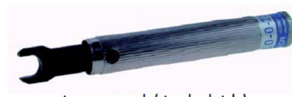
torque wrench (standard style)